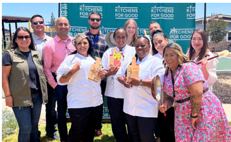
7.7 - Kitchens for Good Graduation

Some of our women served at CCTRP (Custody to Community Transitional Reentry Program) - San Diego recently volunteered with the San Diego River Park Foundation . Four members of the program's Resident Advisory Board (RAB) volunteered with the "Green Team" to clean up the Dog Beach Estuary in Ocean Beach after the festivities of the 4th of July weekend. They were told that if prizes were being given out for the hardest working team, their team would have won! They were very motivated and excited to share about their experience with their peers. Thank you for Uplifting the Human Spirit and representing us in such a great way in your community, ladies!