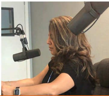
6.22: WestCare California Uses Airtime to Share Our Great Work!