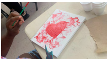
7.4 - The Women and Children of MLK Residential Celebrate Independence Day!

The women and children at MLK Residential had an eventful Fourth of July this year! They celebrated the day by painting, holding a tether ball match, and playing BINGO! They also got the opportunity to enjoy a firework show with some hotlinks and hamburgers! To our amazing staff at MLK Residential who helped make another holiday a memorable one for those that we serve – thank you!